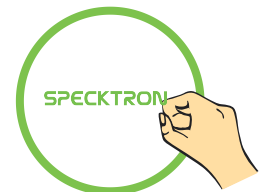
Erase With Palm