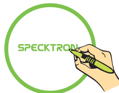
Write With Pen