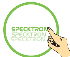
Move With Finger